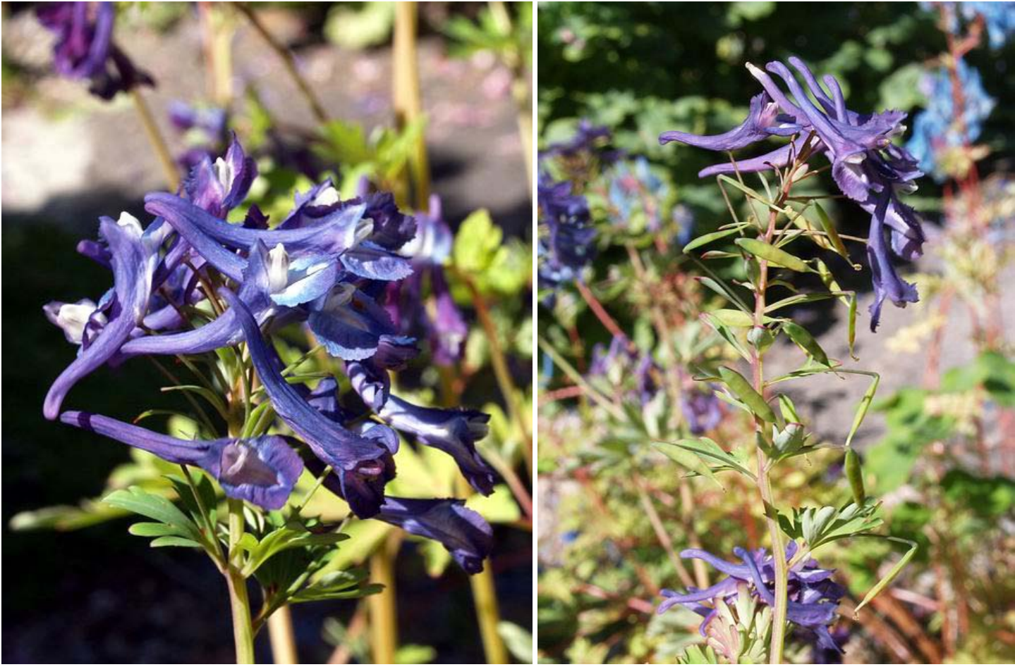
Corydalis 'Craigton Blue' x Corydalis capitata