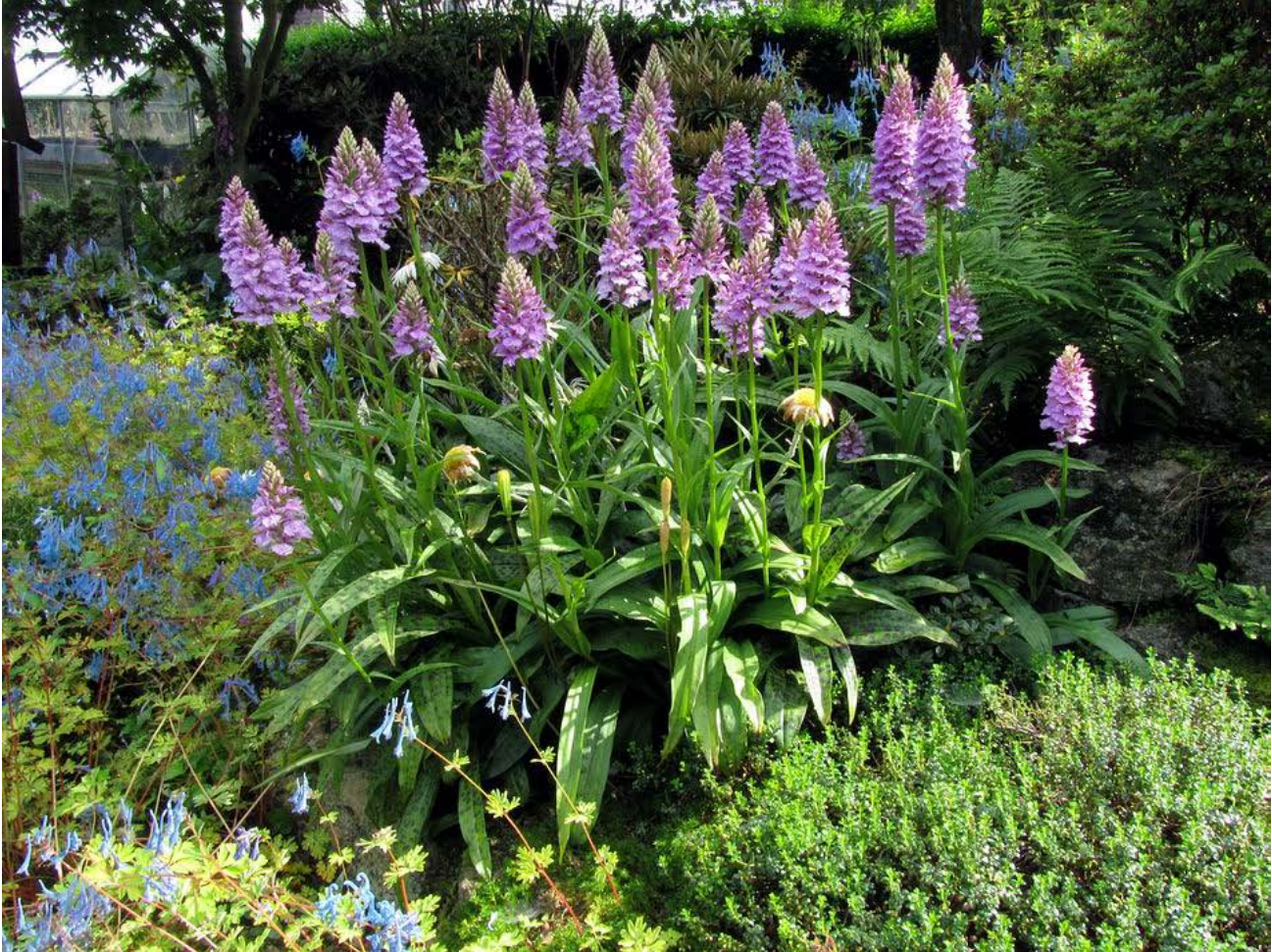
This group has increased from three self sown seedlings that I moved from one of the gravel paths about three years ago.