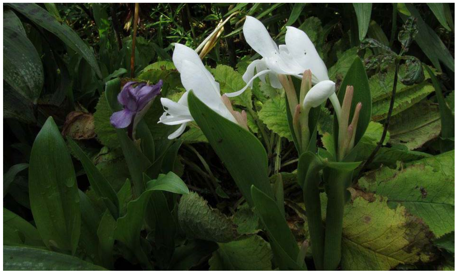
But delve deeply into the lower growth and you will see that at last the Roscoea are now also making an appearance.