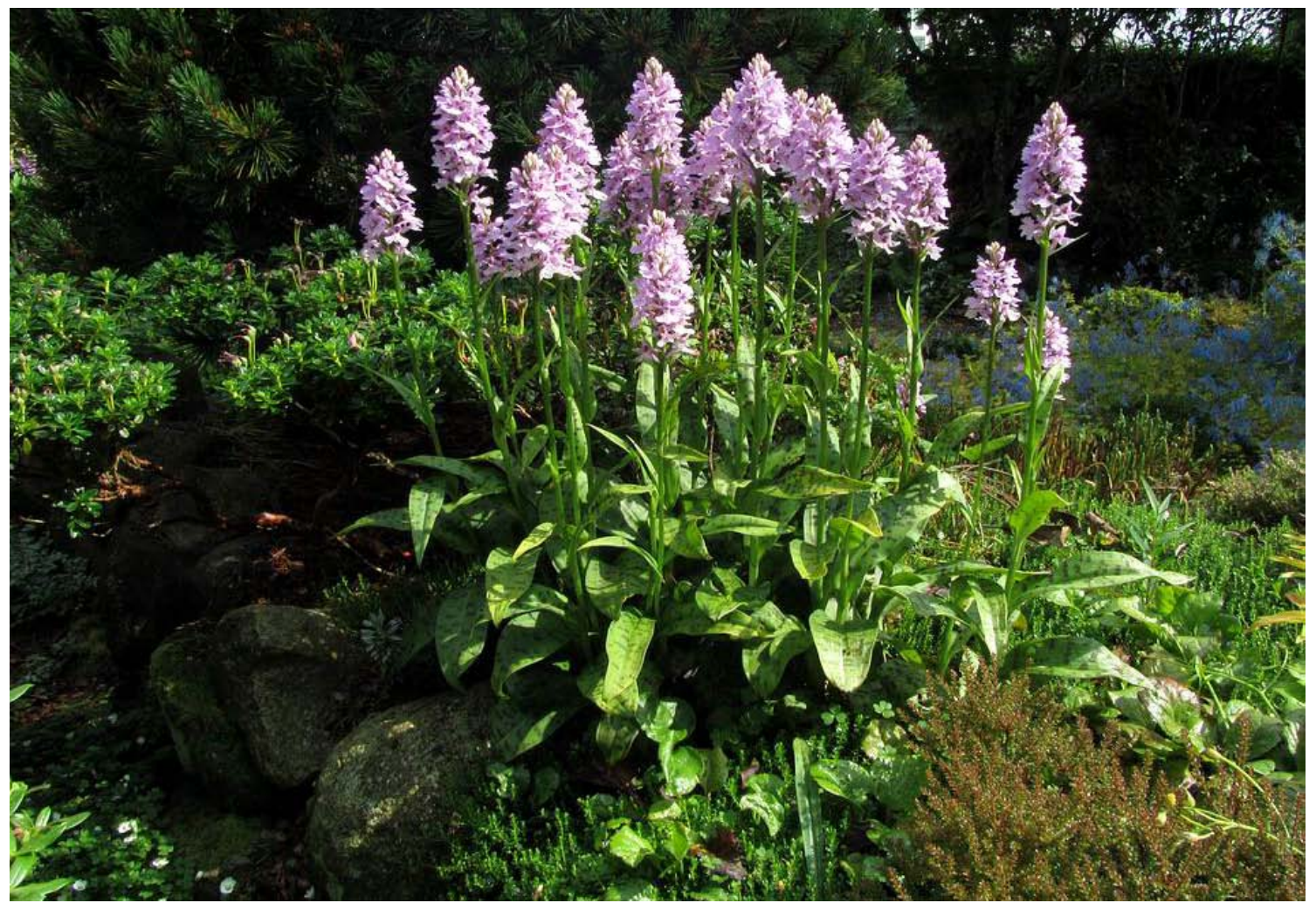
I split this clump Dactylorhiza last year.